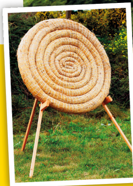
A medieval target.

Archers would take aim through these windows.